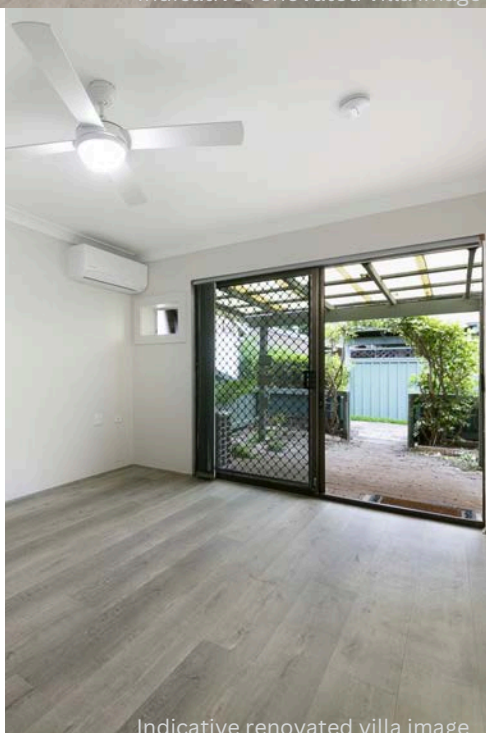
Indicative renovated villa image

Windsor Country Village is independent living in a tranquil, garden setting, offering privacy yet companionship in a secure and pleasant environment. This newly refurbished Villa gives you the privacy and seclusion of your own home with the freedom to enjoy the village facilities.