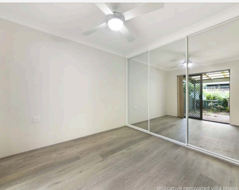
Indicative renovated villa image