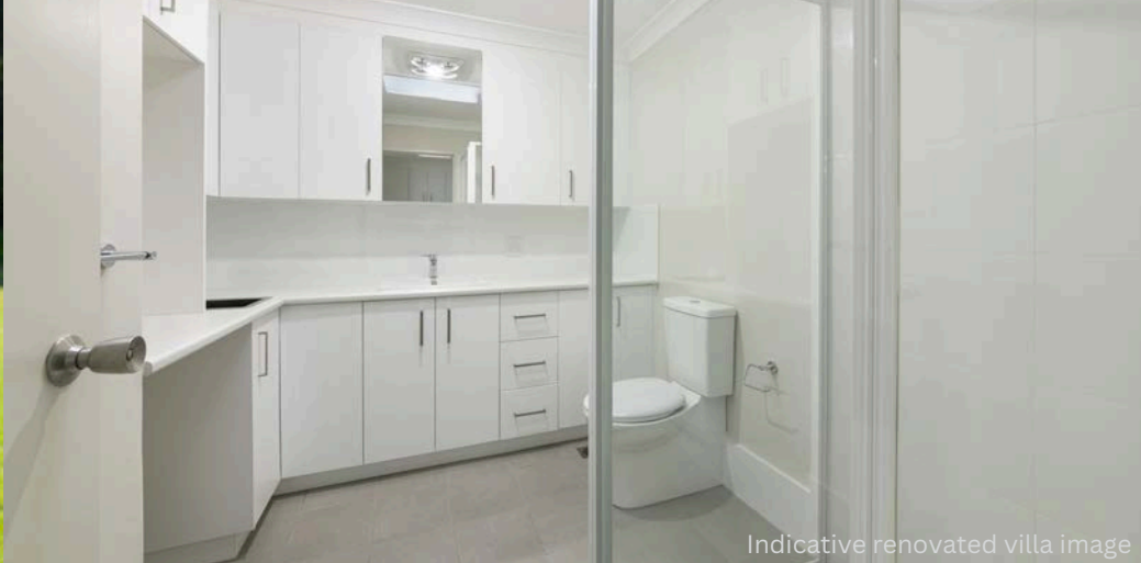
Indicative renovated villa image